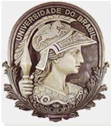
Praia Vermelha Campus